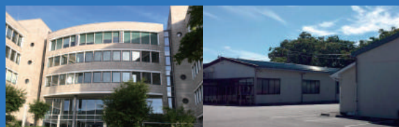
Current Europe GmbH